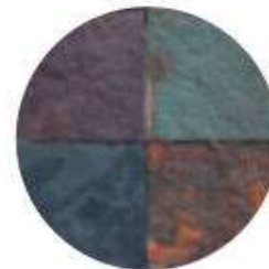
Porcelain gres (very hard)