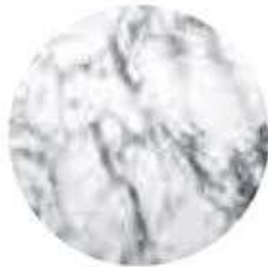
Marble (all types)