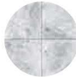
Wall ceramic tile