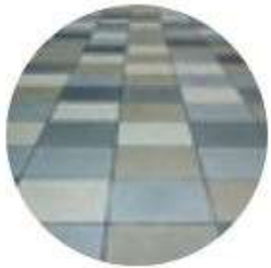
Floor ceramic tile