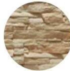
Sandstone (all types)